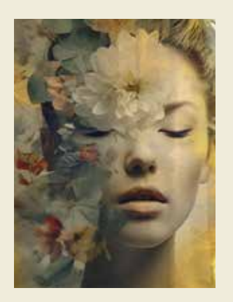
Turner-Fischer Center for Opera Presents: Candide

Written by Tulane University students, led by a team of professional artists, Roleplay depicts several college students who navigate the university system, sexual assault, party culture, and social pressures. Roleplay is transcribed directly from the improvisations of actual college students.