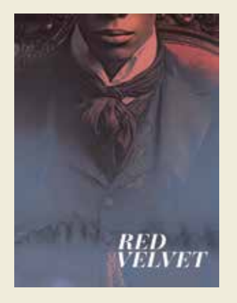
Swine Palace Presents: Red Velvet