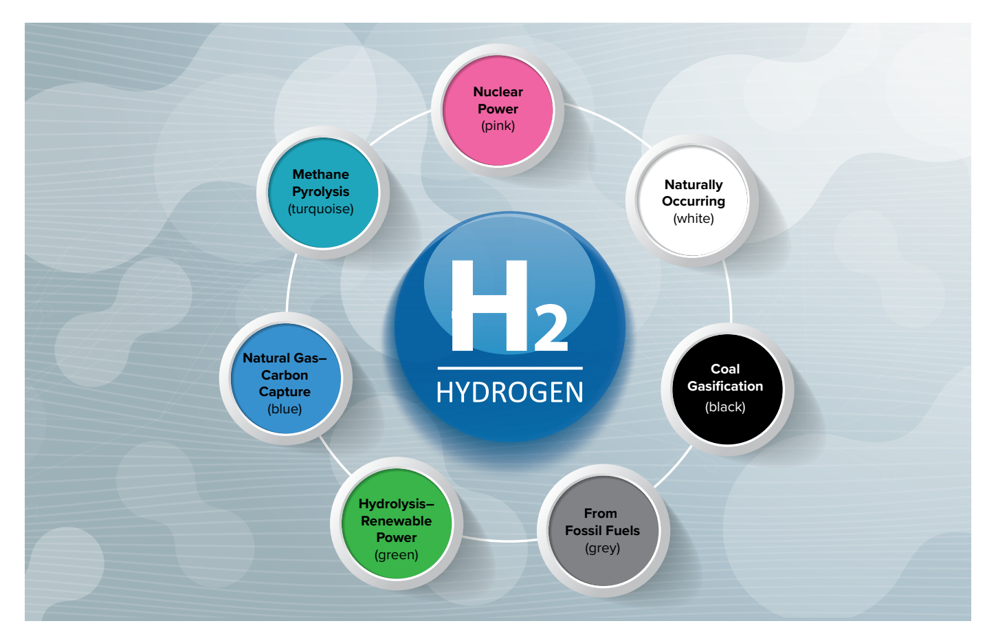
Figure 1: Hydrogen Color Wheel

Hydrogen can be produced in many ways, and its production process affects its carbon intensity and its eligibility for tax incentives. Since hydrogen is usually found in nature bound to other elements (e.g., to oxygen, in the case of water or carbon, in the case of hydrocarbons), it needs to be separated, which requires energy. A color-coding system is commonly used to describe the process to obtain hydrogen, although the end product (hydrogen) is the same in all cases. An illustration of common color coding is shown in Figure 1. Broadly, there are two ways to produce hydrogen: (1) using electricity to split hydrogen and oxygen from water (called electrolysis), and (2) using hydrocarbons (such as methane, coal, etc.) to produce hydrogen (through processes such as steam reforming).