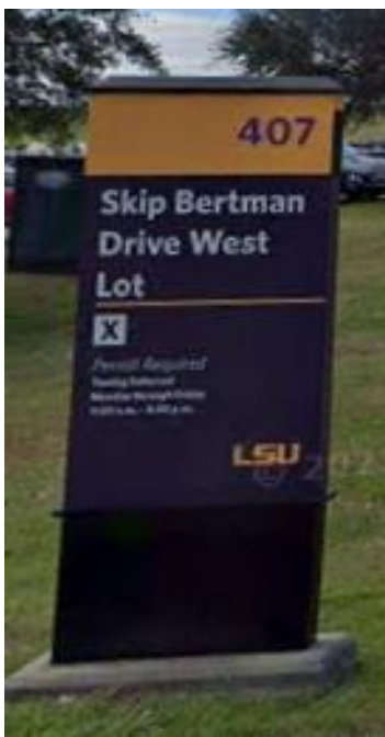
Above Image: Lot 407: Skip Bertman Drive West Lot Entrance Sign Right Image: Overhead image of parking lot.