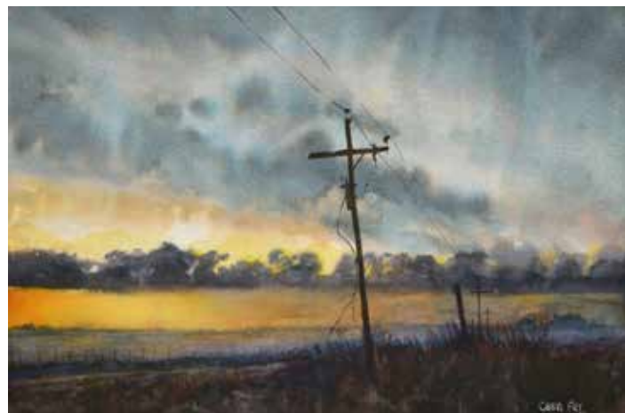
"Connected" by Cheri Fry

In reflection they noted the steps they've made so far, such as the move to use an online service to accept and process the call for entries, the investment in attractive and stable panels to display art in the Orangerie, the purchase of professional rods and clips for hanging art and photographs at various heights in various places, and most importantly the formation of subcommittees within the Brush for Burden committee to divide and conquer the myriad of responsibilities that need to be addressed to ensure the con-