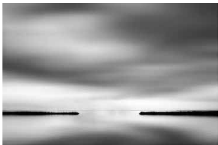
“Quiet Beauty” by Dede Lusk